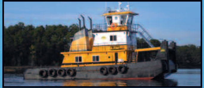
Three engines propel the Mr. Stewart